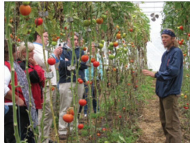
Fletcher Allen Health Care, Burlington, VT