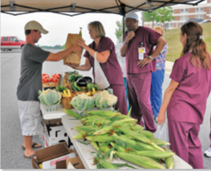
Carroll Hospital Center, Westminster, MD, Farmers Market