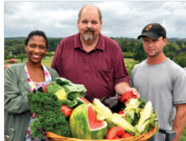
Carroll Hospital Center, Westminster, MD