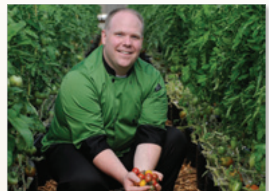
United General Hospital, Sedro-Woolley, WA