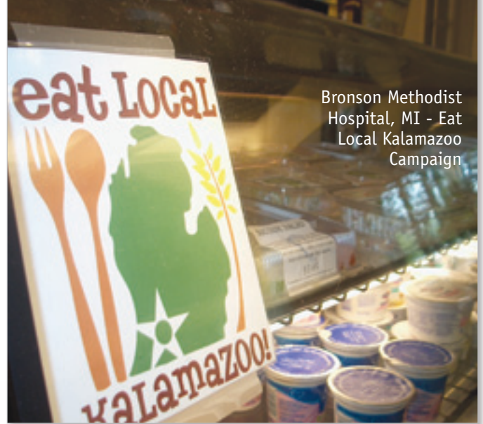
Bronson Methodist Hospital, MI - Eat Local Kalamazoo Campaign

Most facilities [78.6 percent (66/84)] are also using FDA-approved rBGH-free claims to identify dairy products from cows not given recombinant Bovine Growth Hormone (rBGH) to boost milk production, and 47.6 percent (40/84) are using the USDA-approved raised without antibiotics label claims to identify poultry and meat products produced without the use of antibiotics. Next most commonly used label claims include: raised without added hormones and no hormones added for beef and lamb products [34.5 percent (29/84)], USDA grass-fed for beef, dairy and lamb products [25 percent (21/84)] and no genetically engineered ingredients for products made from corn, soy, canola or their derivatives [17.9 percent (15/84)].