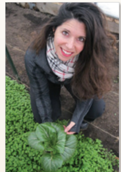
Leader for Nutrition Support, St. Joseph Mercy Health System, MI