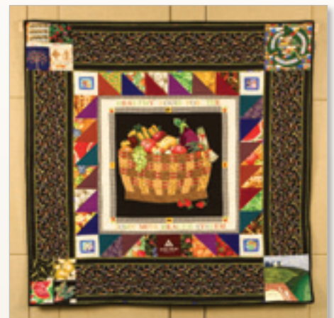
Food Quilt from John Muir Medical Center, Concord, CA