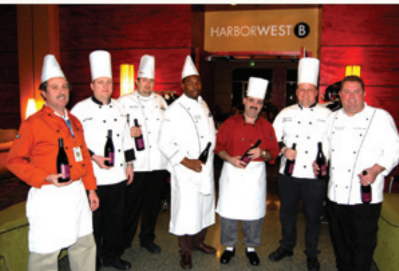
Balance Meets Taste – Event organized by MDH2E

Maryland HFHC partner MD H2E hosted a series of events in 2010 to further engage hospitals in sustainable food initiatives. Their Food Leadership Council of Maryland & DC hosted a dinner fundraiser Balance Meets Taste at which chefs from hospitals and local venues prepared a four-course Balanced Menus meal using local sustainable ingredients. The event raised $2000 for the local sustainable agriculture organization and generated an article in the Washington Post about the HFHC initiative. MD H2E also co-hosted two urban farm tours and the food pre-conference at CleanMed in Baltimore, and partnered with the statewide Buy Local Challenge to engage 38 health care facilities, their employees and community members in serving/eating at least one local food each day for a week at the end of July. They hosted the Environmental Excellence in Health Care conference in November, provided technical support to several hospitals that launched farmers markets and CSAs, and received USDA funding to facilitate local sustainable meat and poultry purchasing initiatives.