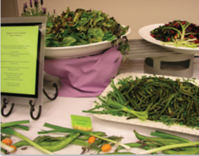
John Muir Medical Center, Concord, CA – Sustainable Foods Display