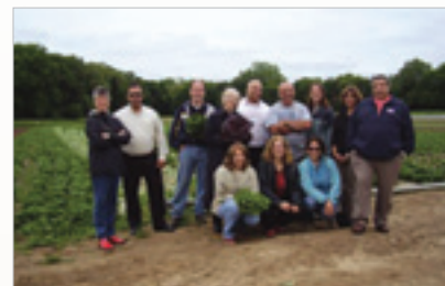
New England HFHC Leadership Team visits Pleasant Valley Gardens, Methuen, MA

In August 2010, HCWH in partnership with the Gloucester Fishermen's Wives Association, Massachusetts Fisherman's Partnership, and the Northwest Atlantic Marine Alliance organized a visit to the docks at Gloucester Harbor, Mass. for New England health care food service professionals to learn about sustainable seafood. In November, a Balanced Menus dinner/ networking event and discussion on sustainable seafood was held in Boston for registered dietitians. Healthlink, a HFHC partner organization, participated in the Boston Food and Fitness Collaborative's efforts to improve access to fresh local foods and explore opportunities to incorporate Boston hospitals in the outreach. The HFHC Sugar Sweetened Beverage (SSB) Project was also initiated in MA in 2010. HCWH piloted the Food Matters Clinical Education program in Boston in May of 2010. Outside of MA - MaineHealth facilities continue to engage in leadership around sustainable food procurement and obesity prevention programs. Rhode Island's Hospital Association has called upon HCWH to help further their health care food service sustainability goals.