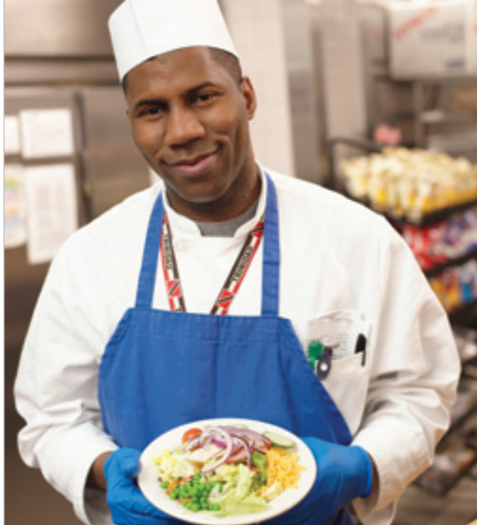
Sparrow Hospital, Lansing, MI – Chef prepares nutritious meal

Hospitals are beginning to pay more attention to the availability of sugar sweetened beverages. Fairview Hospital, Berkshire Health Systems, Great Barrington, Mass. adopted a “Sugar Sweetened Beverages Sales Elimination Policy” in 2010. In the policy sugar sweetened beverages were removed from all areas - cafeteria, catering, vending, and patient menus (while continuing to remain available to patients upon a clinician’s request). Menus now offer tap water, locally sourced milk, 100 percent juice, flavored water beverages, and unsweetened iced tea.