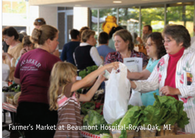
Farmer's Market at Beaumont Hospital-Royal Oak, MI

Thus only facilities that had signed the Pledge or had adopted a formal sustainable food policy before the end of 2010 were considered for a HFHC Award and having done so is a pre-requisite for earning points under the GGHC food service credits.