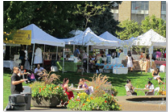
Oregon Health & Science University, Portland, OR