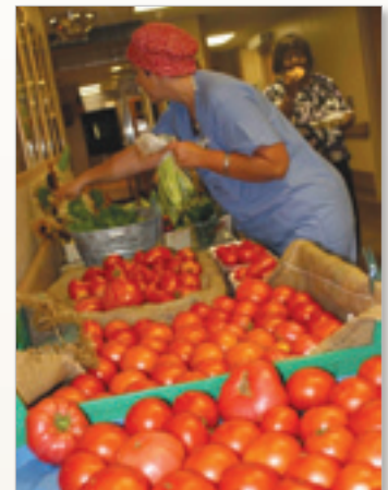
Sparrow Hospital, Lansing, MI